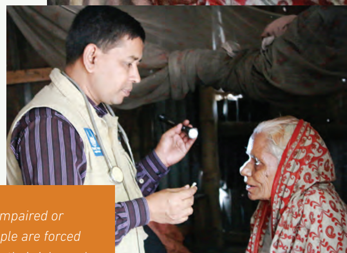
An eye doctor checking Dilejan's eyes

We implemented a project to improve the eyesight of 825 people through cataract screening and primary eye care. We also held awareness sessions for around 1,000 people, teaching them about appropriate hygiene routines, how to prevent and cure certain eye issues and how to overcome every day issues.