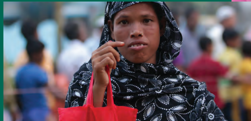
Mother of 8 children from Sylhet delighted to receive Qurbani meat from IR Bangladesh

In 2015, we provided 205 families living in vulnerable communities with Qurbani meat.