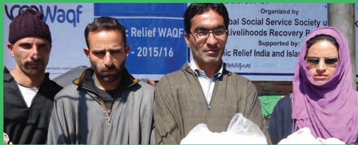
Raw material support provided to carpet weavers in Nowgam village (Jammu and Kashmir).

To keep up with debt repayments, they've had to sell the few remaining possessions they have left.