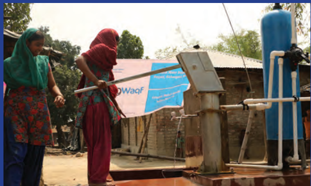
Young girls in Dhardharia Village in Pothia fetching safe drinking water from the recently installed hand pump with iron removal system.

Community meetings were also held to discuss the importance of safe water and hygiene.