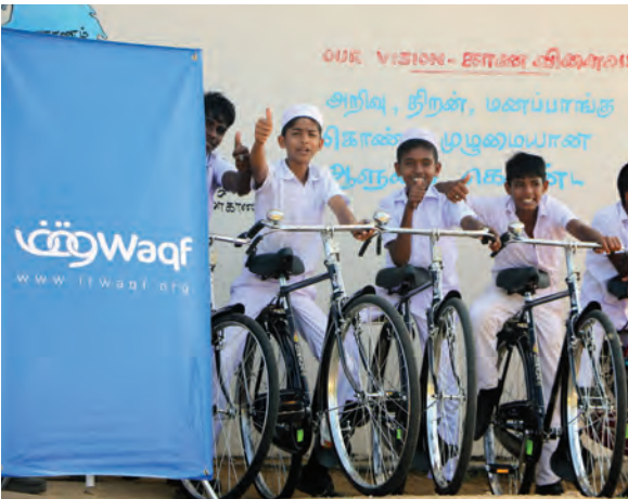
Excited students show their appreciation after receiving new bicycles from Islamic Relief, Pottuvil, Ampara, Sri Lanka. This project was funded by Waqf.

The total Waqf revenue for 2015 was 253,504 GBP , from which the return on investment will be used to fund projects in 2016.