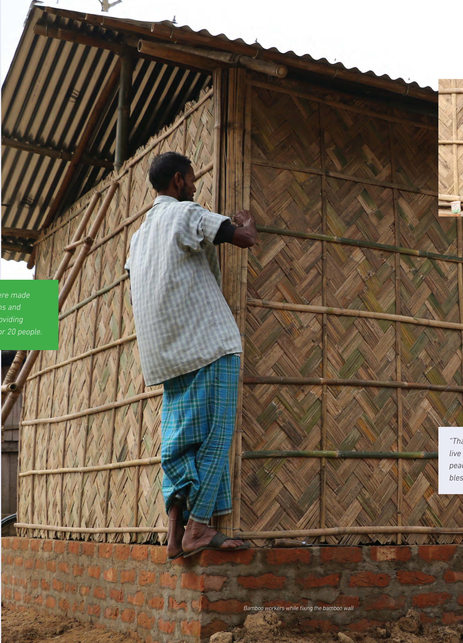
Bamboo workers while fixing the bamboo wall

The houses were made by local masons and carpenters, providing employment for 20 people.