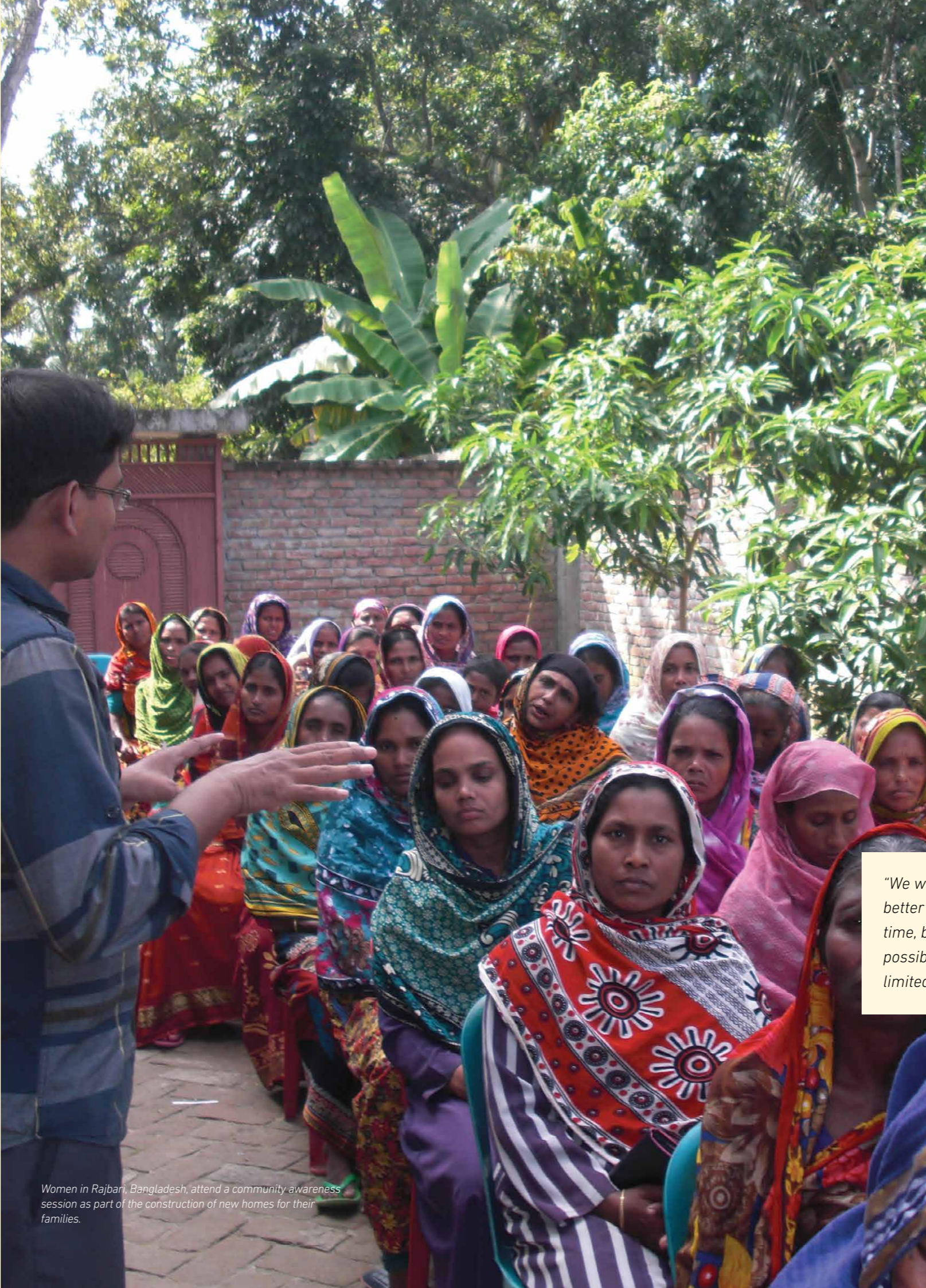
Women in Rajbari, Bangladesh, attend a community awareness session as part of the construction of new homes for their families.

In 2014, Islamic Relief Waqf also distributed 108 winter blankets to 36 families of sponsored orphans in Al Shejaeya and Beit Hanoun in Gaza, Palestine. Both regions were devastated in the conflict and many families returned to find their homes completely destroyed – and with them all of their belongings. Each family received three blankets to help protect them against winter temperatures.