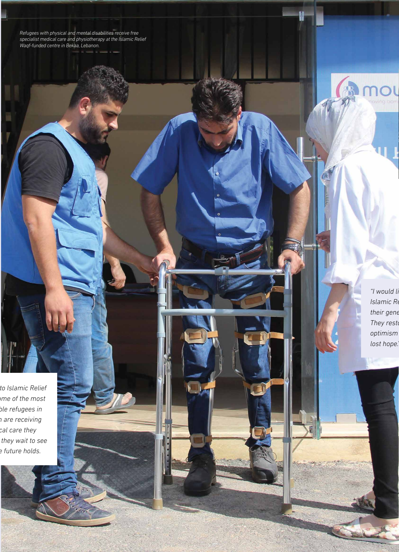
Refugees with physical and mental disabilities receive free specialist medical care and physiotherapy at the Islamic Relief Waqf-funded centre in Bekaa, Lebanon.

Thanks to Islamic Relief Waqf, some of the most vulnerable refugees in Lebanon are receiving the critical care they need as they wait to see what the future holds.