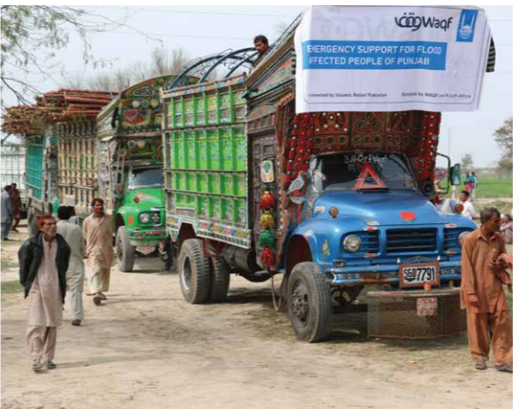
Above: Trucks loaded with emergency shelter kits arrive in Jhang, Pakistan, in the aftermath of devastating monsoon floods.

The total Waqf revenue for 2014 was 454,114 GBP , from which the return on investment will be used to fund projects in 2015.