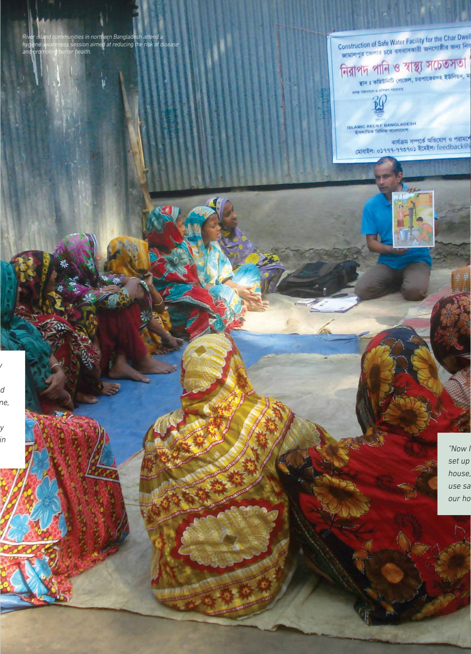
River island communities in northern Bangladesh attend a hygiene awareness session aimed at reducing the risk of disease and promoting better health.

The local community helped identify the families most in need of a well in their home, including those who could not realistically afford to install one in their lifetime.