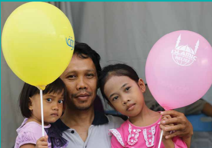
Above: A family in Lombok, Indonesia, visits an exhibition featuring mushroom products from a women's livelihood support programme.