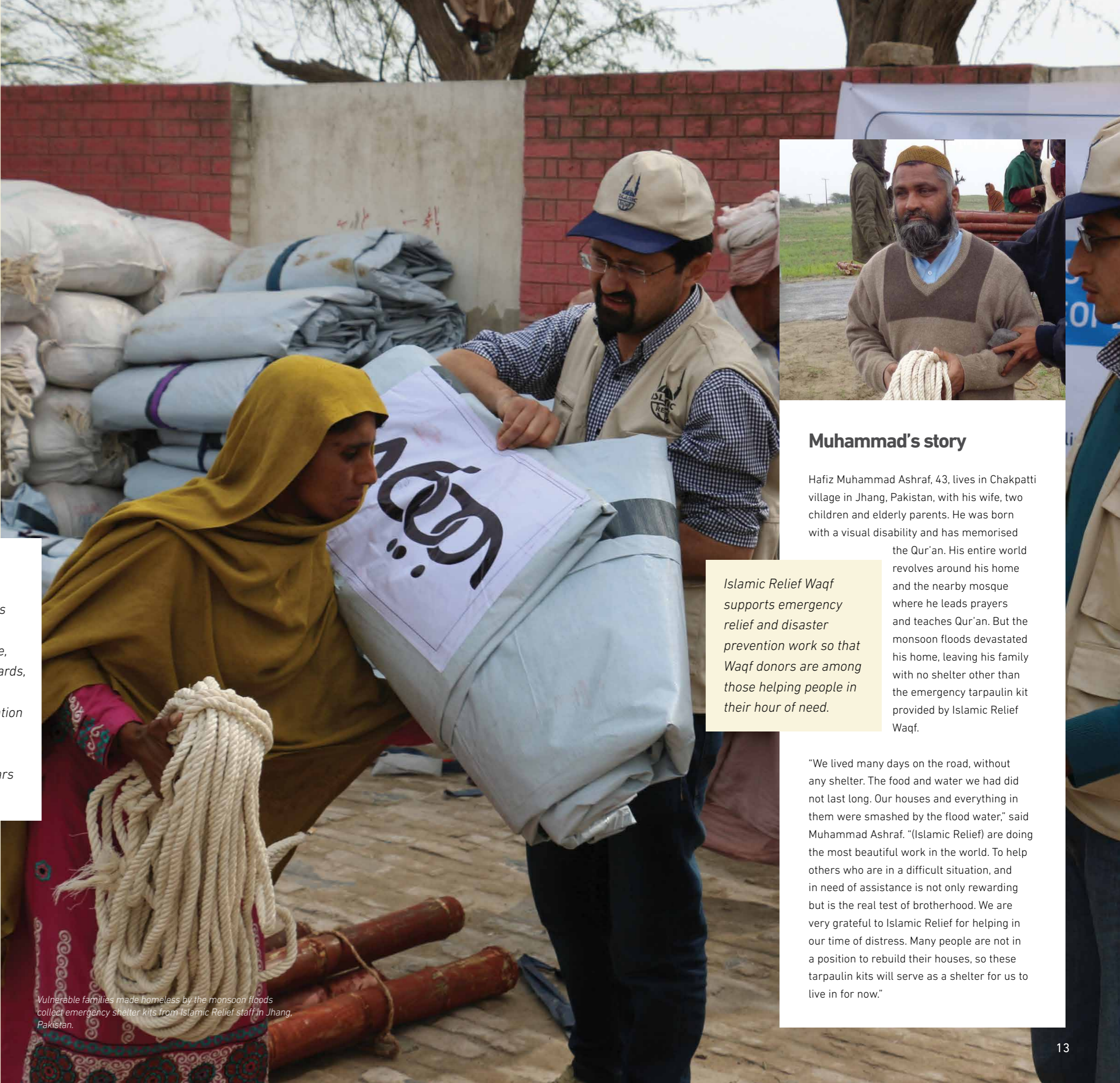
Vulnerable families made homeless by the monsoon floods collect emergency shelter kits from Islamic Relief staff in Jhang, Pakistan.

Working alongside Islamic Relief staff gave local volunteers an insight into emergency response, humanitarian standards, field ethics and community mobilisation – experience that will benefit their communities for years to come.