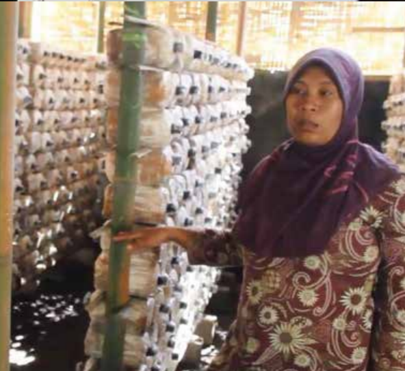
Women in West Lombok, Indonesia, prepare mushroom seeds that they will harvest, use in products and sell to give them an alternative source of income.

With the help of Islamic Relief Waqf, some of the poorest people in Indonesia now have a sustainable income to help meet the needs of their families and build a better future.