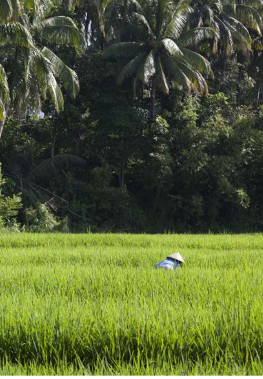
Project cost: £30,000 Beneficiaries: 93 families